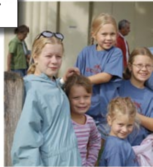
Making Memories Going to the Minnesota