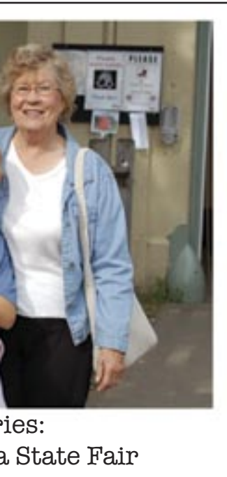
ies: a State Fair

Note: World Missions will NEVER send you a bill. If you haven't received anything from AGWM recently, please send your support to AGWM, 1445 N Boonville Ave., Springfield, MO 65803, Acct. 2477537. AGWM will then resume sending you receipts and a return envelope.