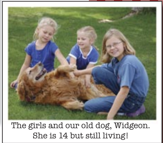
The girls and our old dog, Widgeon. She is 14 but still living!