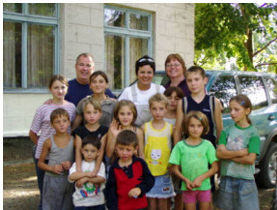
Some of the Princeton team with kids at Bread of Life ministry, a feeding program for kids without food.

Building His Church! We were blessed to host a group from Princeton, Minnesota. They worked on two church buildings; framing, concrete, painting, and much more. Their hard work and joyful spirits were an encouragement to the churches here. In addition to building, they also ministered in the schools (and, yes, talked about Jesus!), in the prison, and in many homes.